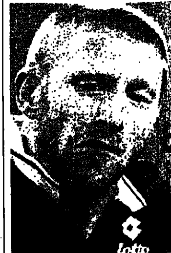
Becker... imperious form

There are no ranking points for the Grand Slam Cup. If there were, Henman would have least several places, although his end-of-year position of 29 is testimony to the